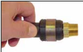
4. Slide assembly ring to lock position.