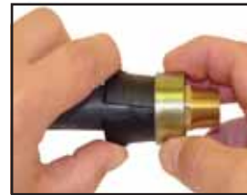
3. Position remaining plastic case piece over assembly