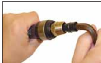
5. Using the supplied wrench, insert the greased lock stem, push and turn until flush inside the fitting.