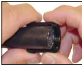
1. Trim hose end. Place one half of plastic case on hose, flush with lock groove.