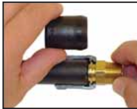
2. Insert threaded fitting into lock groove.