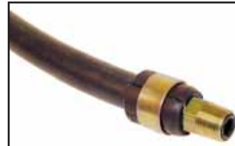
6. Finished assembly is now ready for installation